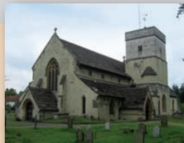
ST MICHAEL'S CHURCH, BETCHWORTH